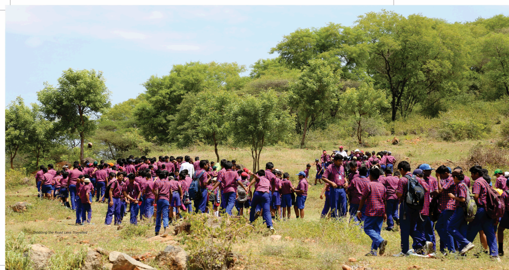
Trodding the Road Less Travelled