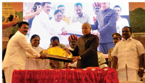
Our Chairman presenting a memento to His Excellency, Shri Banwarilal Purohit , Hon'ble Governor of Tamilnadu in 2018.