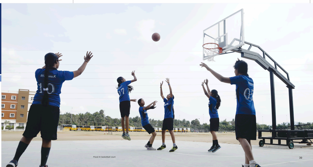
Flood-lit basket ball court